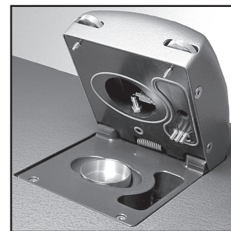
◀ AquaSorp sample chamber.

*Depends on the user selectable flow rate and sample type.